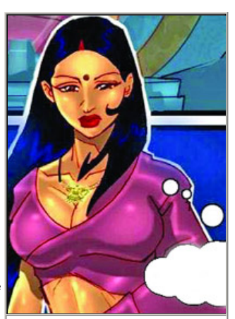
A cartoon strip from Bhabhi's adventures

I do have a strong social responsibility and keeping children out of the site is one of them. However, rather than just have a 'customary' warning page which really does not serve any purpose, we have put up a link to a website from where parents can get information about blocking not only Savita Bhabhi, but any website that they might find objectionable. The link is: http://www.rtalabel.org/parents.php